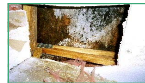
Destructive access to ceiling plenum reveals mold growth