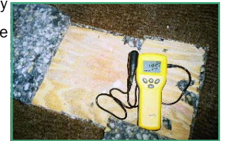
Moisture meter reading of sub-floor

Inspection of the study site to determine if the work area is visually free of significant water damaged materials, fungal