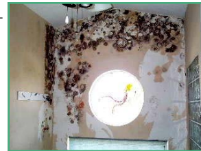
Mold growth discovered under wallpaper